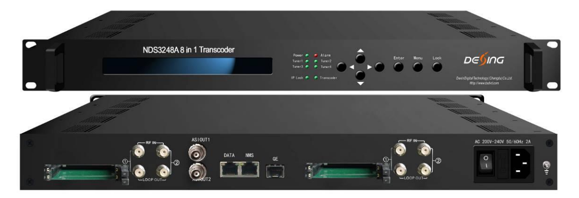
4 CI Slots = 4*CAM + 4*Smartcard